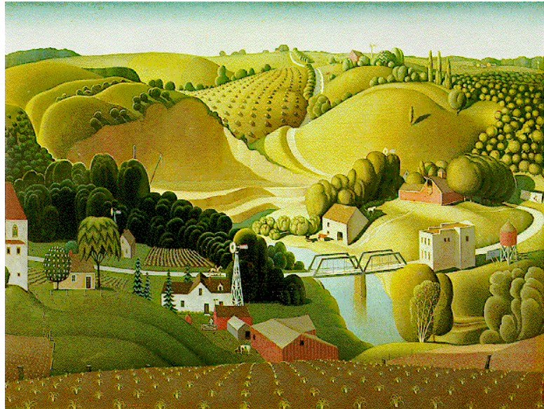
Stone City ~ Grant Wood