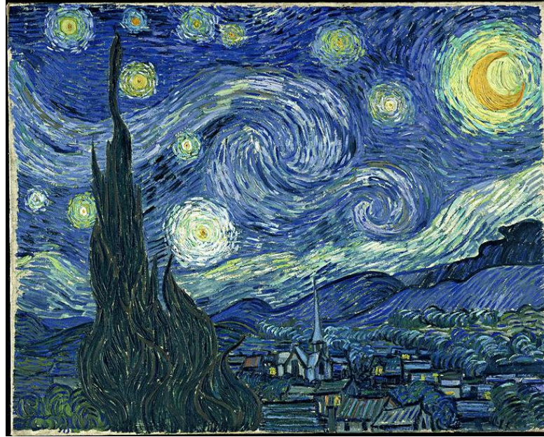
The Starry Night (1889)~ Vincent van Gogh

Quarter 4: April 8 th , May 6 th , May 27 th , June 2 nd